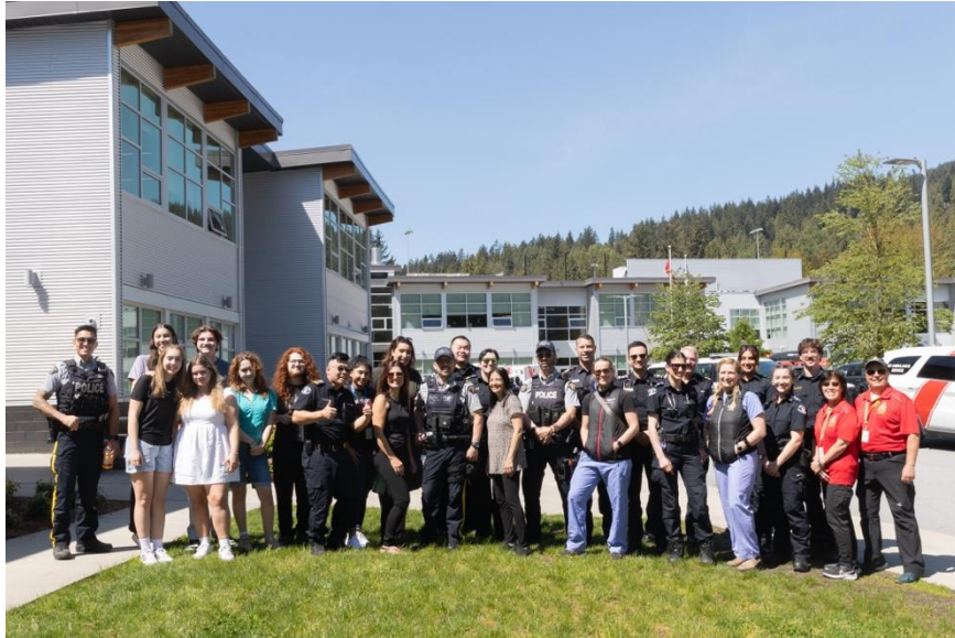
Above: First responders & Argyle student actors