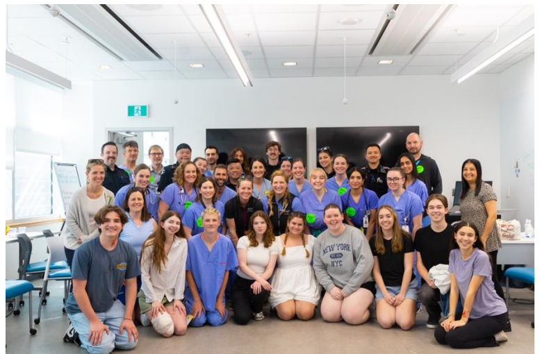
Right: VCH staff, Argyle student actors & staff