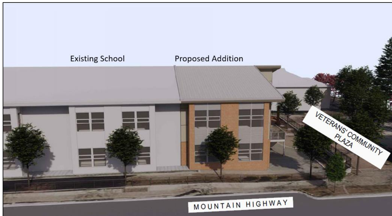
View from Mountain Highway showing the proposed addition in colour and the existing school in pale grey.

We would like to inform you that the North Vancouver School District has submitted a Development Variance Permit application to the District of North Vancouver municipal Planning Department for a proposed addition to Lynn Valley Elementary School. We would also like to provide you with an opportunity for questions and comments.