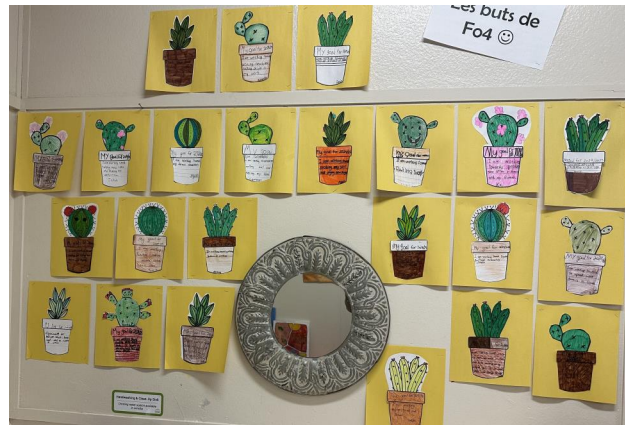
1 - Artwork from Division F04 (Mme. McCurrach/Mme. Terrillon)