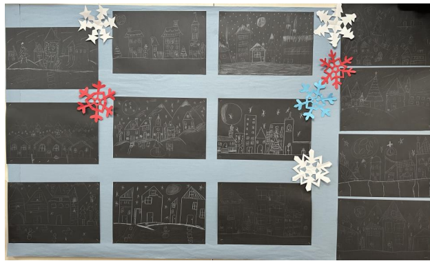
2 - Artwork from Division F04 (Mme. McCurrach/Mme. Terrillon)