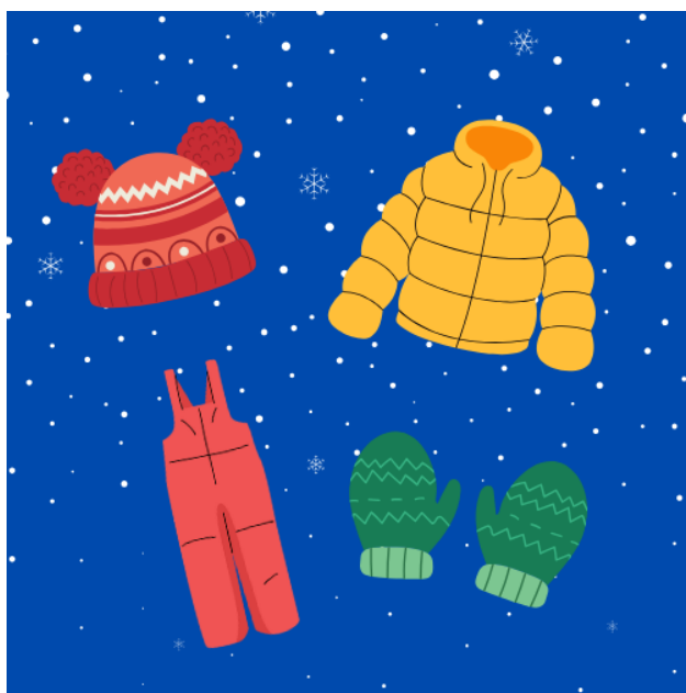
6 - Click HERE for the North Vancouver weather report.