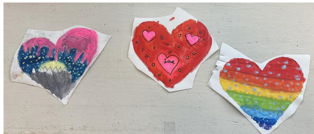
Artwork from Division F09 (Mme. Robitaille/Mme. Cynthia) - Students worked hard on this art project reflecting all the different skin colours.