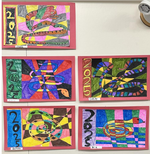
7 - Artwork from Division F04 (Mme. McCurrach/Mme. Terrillon)