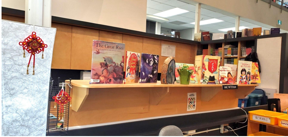
2 - A collection of curated books from Mme. Patterson to celebrate the Lunar New Year.