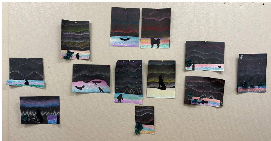
4 - Artwork from Division F03 (Mme. Stachowiak)