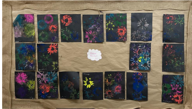
6 - Artwork from Division F12 (Mme. Swain)