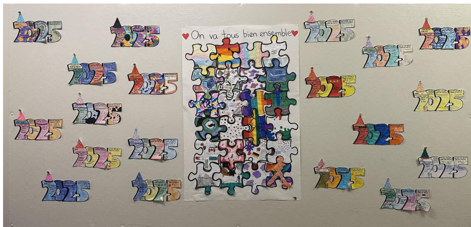
4 - Artwork from Division F03 (Mme. Stachowiak)