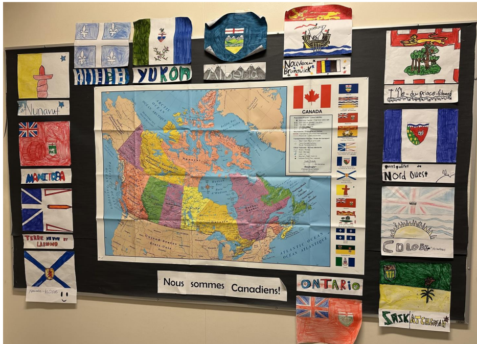
3 - Artwork from Division F04 (Mme. McCurrach/Mme. Terrillon)