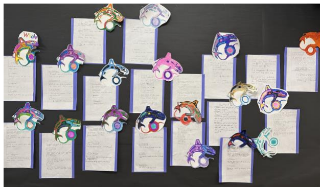
10 - Artwork from Division F04 (Mme. McCurrach/Terrillon)