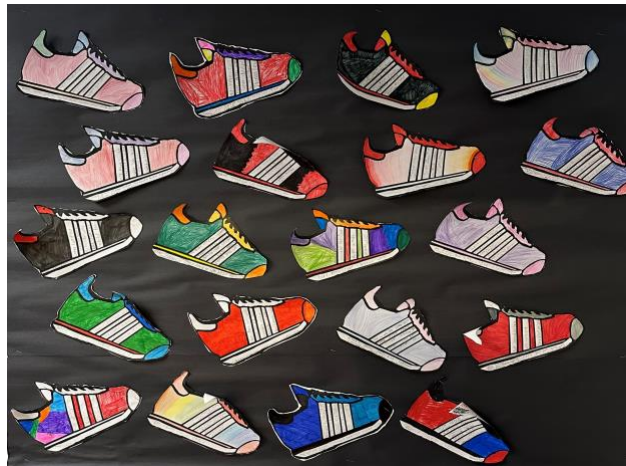
9 - Artwork from Division F04 (Mme. McCurrach/Terrillon)