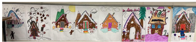
6 - Artwork from Division F04 (Mme. McCurrach/Mme. Terrillon)