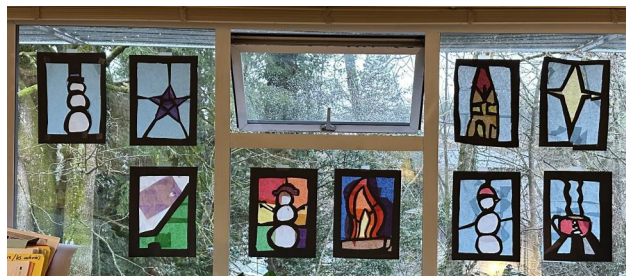
7 - Artwork from Division F04 (Mme. McCurrach/Mme. Terrillon)