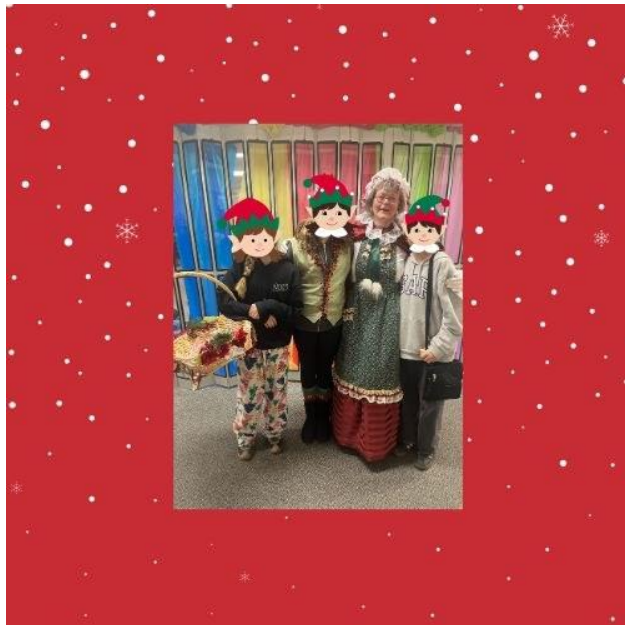
3 - Mrs. Claus stopped by to spread some holiday cheer and visit with students! Thank you for making school extra special this week.