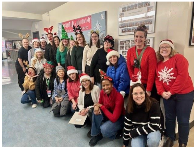
1 - Staff photo for festive hat day!