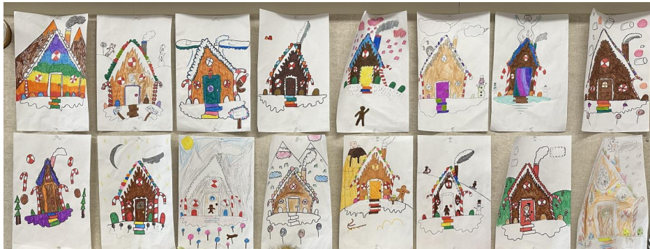
5 - Artwork from Division F04 (Mme. McCurrach/Mme. Terrillon)