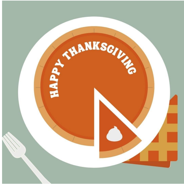
1 - "Gratitude unlocks the fullness of life." - Melody Beattie

With Thanksgiving approaching, we want to take a moment to express our gratitude to all the staff, students and families of Larson that make our community so very special. We hope everyone has a wonderful long weekend, spent with family and friends.