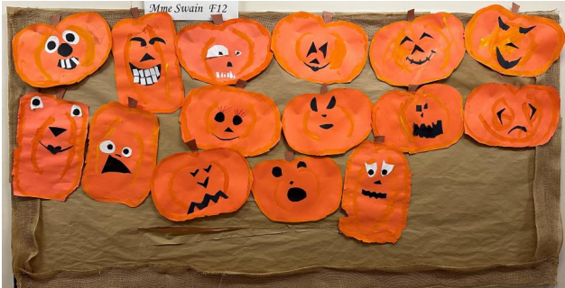
2 - Artwork from Division F12 (Mme. Swain)