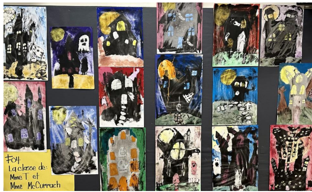
1 - Artwork from Division F04 (Mme. McCurrach/Mme. Terrillon)