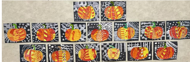
5 - Artwork from Division F08 (Mme. Chapman/Mme. Shandro)