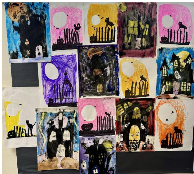
2 - Artwork from Division F04 (Mme. McCurrach/Mme. Terrillon)