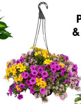
Planters & Baskets