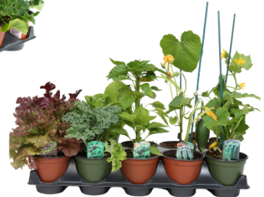
Herbs & Veggies