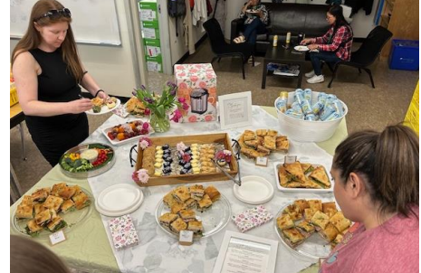
The PAC organized a Staff Appreciation Lunch!

While our four-legged friends are usually just that – friends – some staff and children at school are allergic to dogs while others can often be frightened of them. Even when leashed or tethered to a fence, dogs can be unpredictable especially when the owner is not present. Please review the <u>District of North Vancouver by-law</u> for dogs on school property and share this with all caregivers who pick-up/drop-off at the school.